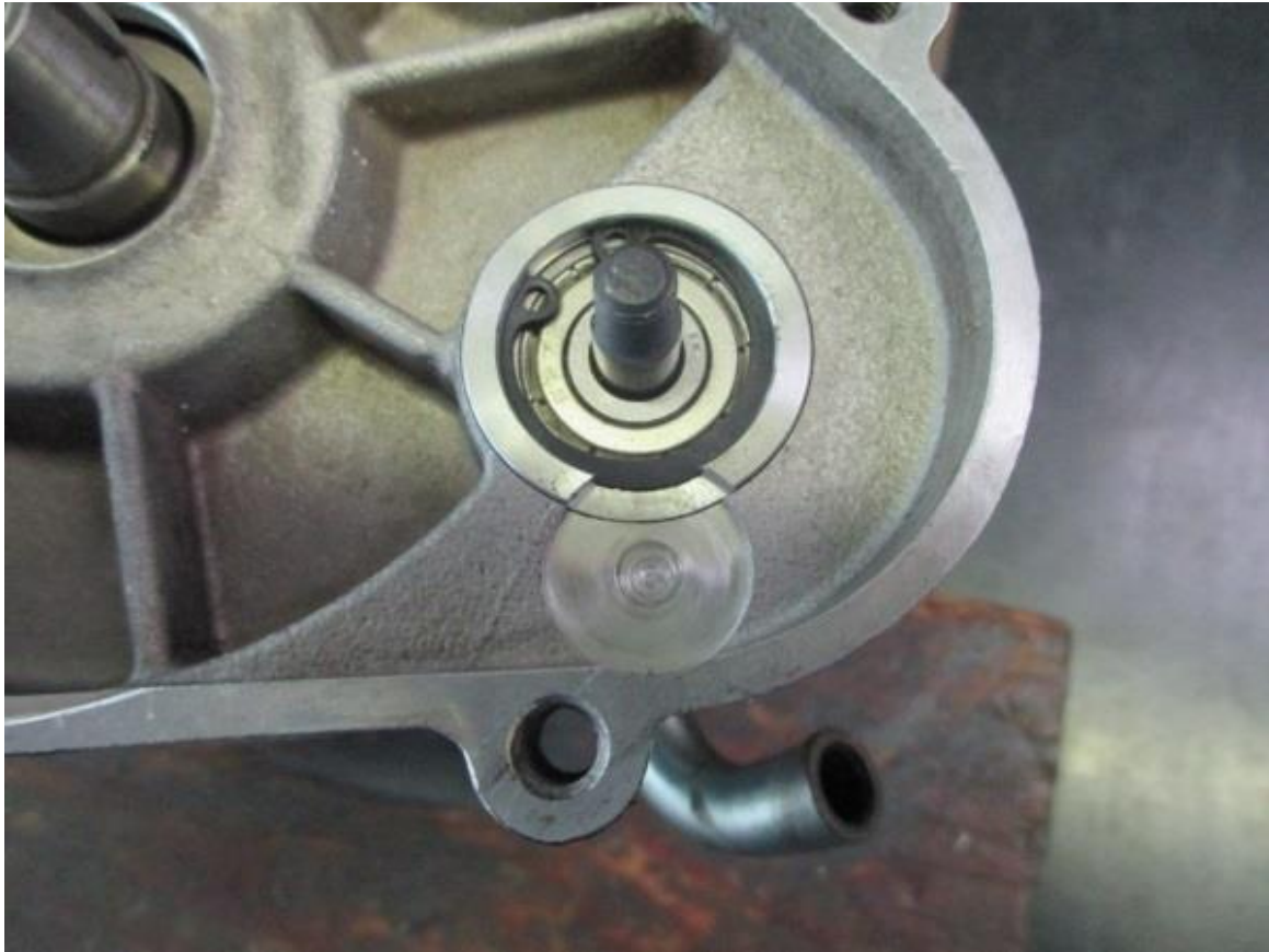
13) Correct fit of water pump case inside the crank case