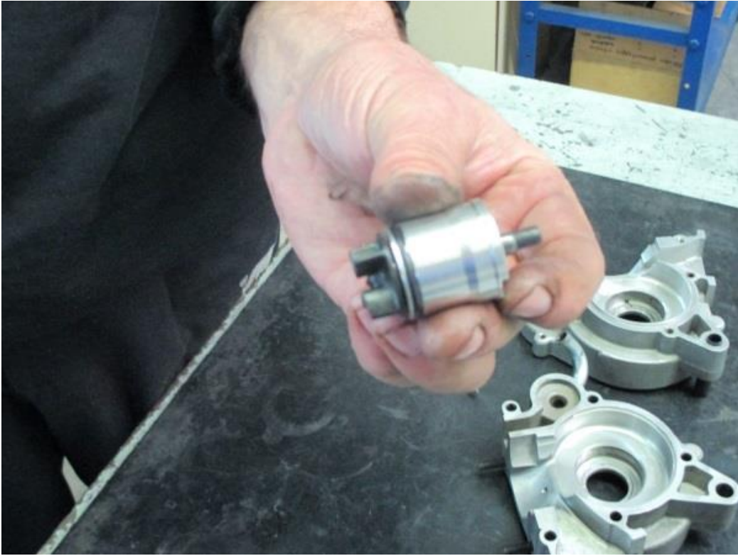
11) Water pump case is ready for assembly