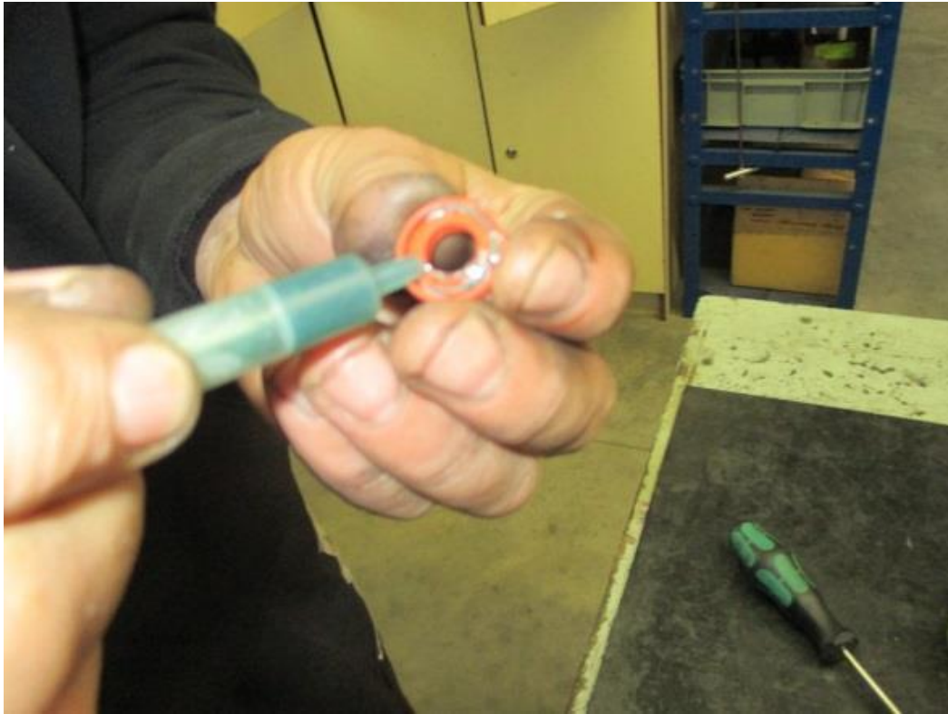
7) Before adding the „Gufero“ seal, spread with grease