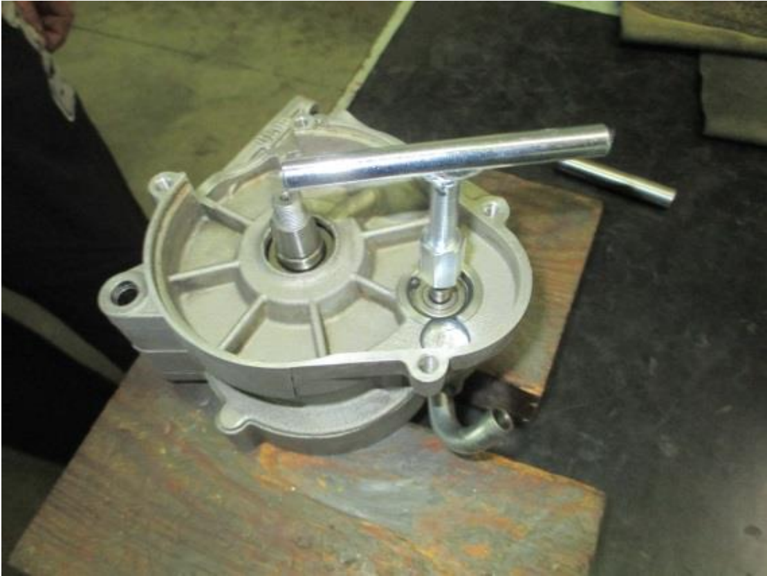
15) When dismantling water pump case from crank case use special tool