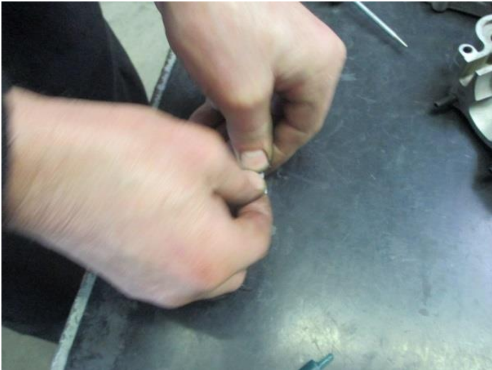
8) Push the greased seal inside the case