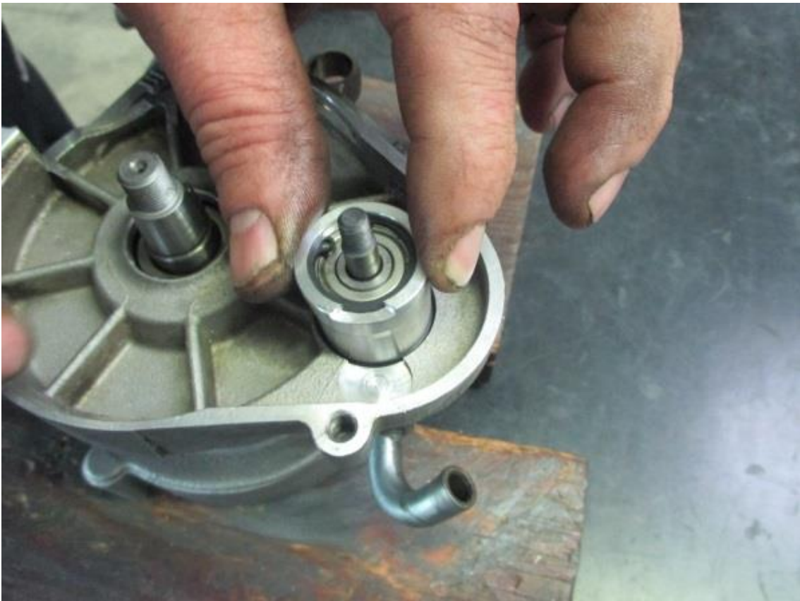
12) Insert the case into the crank case