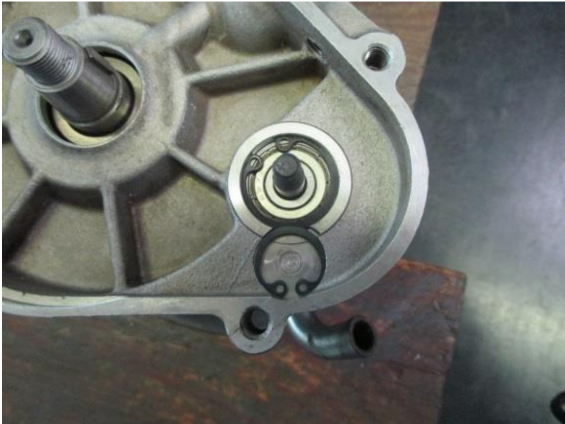
14) Secure the pump case with safety lock