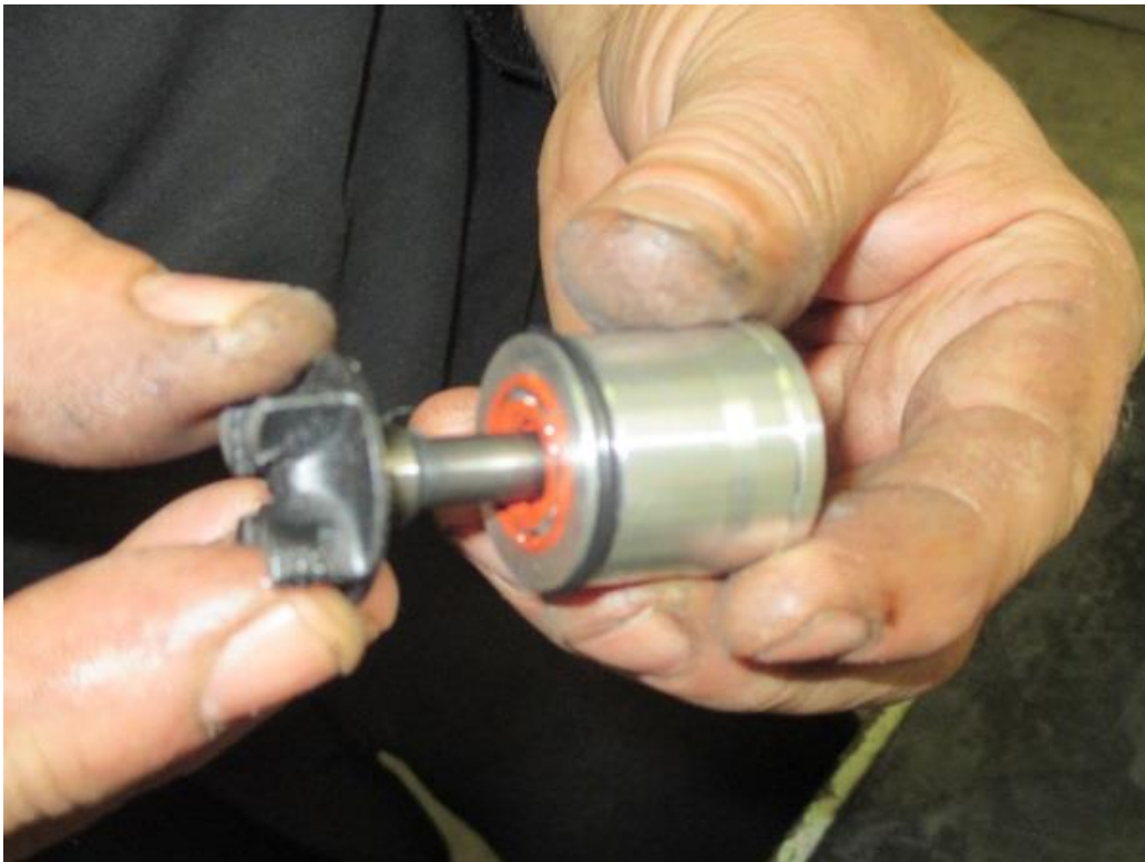
10) Insert the shaft inside the pump case