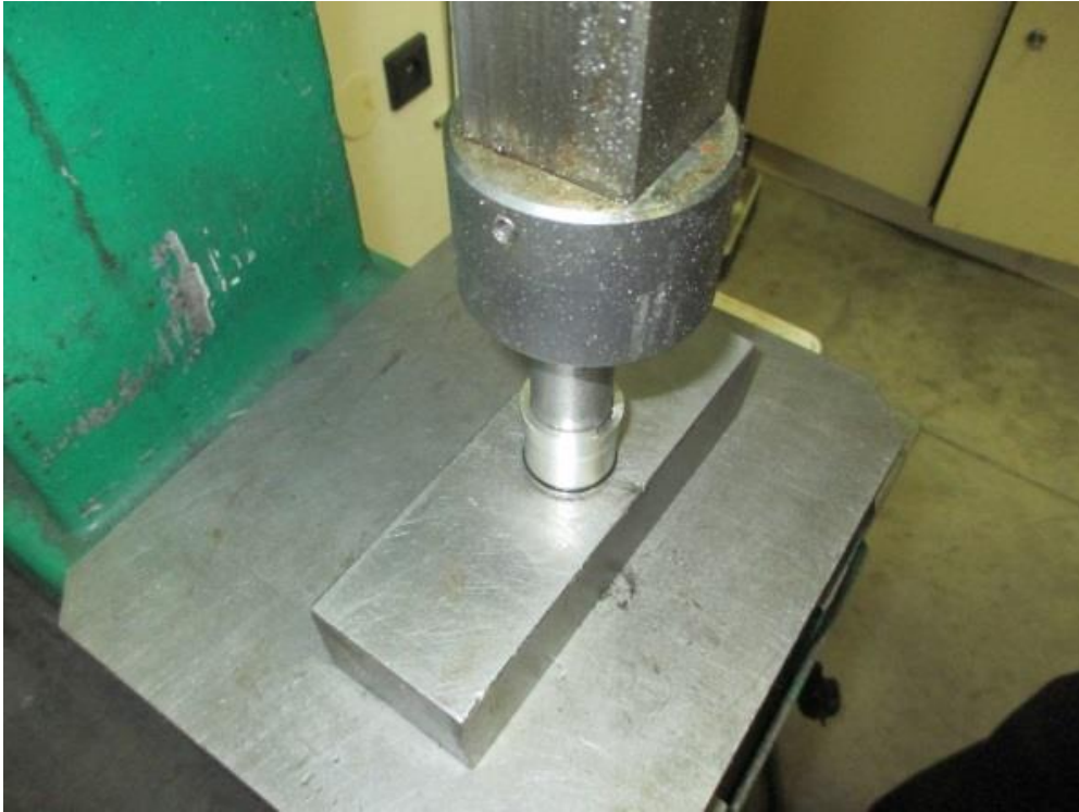
5) Press second bearing into pump case