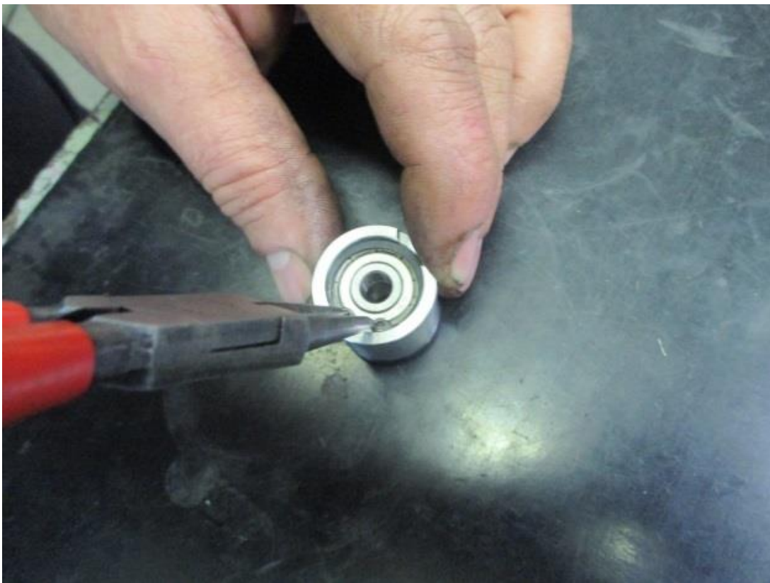
6) Secure the bearing with safety lock