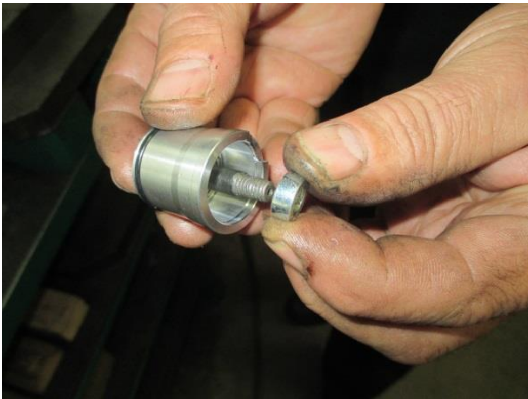
4) Place L=5 spacer inside. Screw is used only for centering the spacer