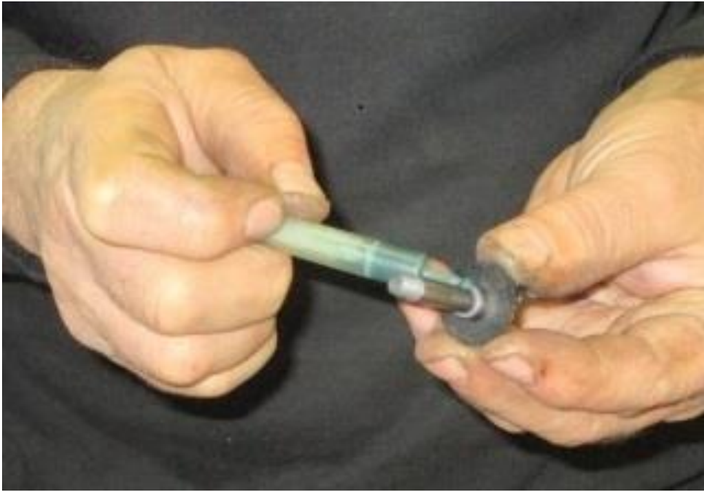
9) Grease the water pump shaft assembly